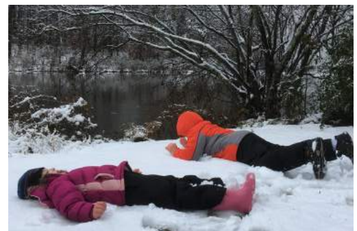
Submitted by Mandy Finch