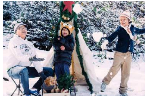
Submitted by Zulma Luna