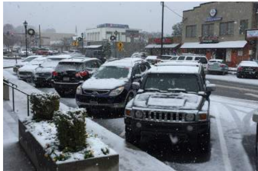
Submitted by Ginnie Campbell