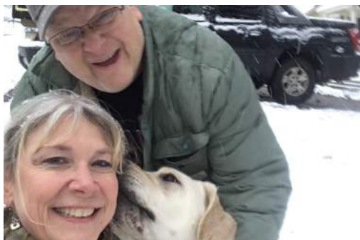
Submitted by Ellen Stillwell