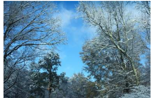
Submitted by Ellen Stillwell