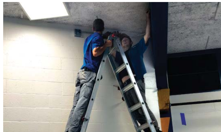
Electricians work on wiring upgrades at Tucker Recreation Center. These electrical improvements will save Main Street Theatre productions countless manhours in the future.

The next big production will be Sanders Family Christmas , a musical debuting November 30 at the Recreation Center. Before that, the troupe will be busy with an offsite production entitled Escapade . The interactive theater event will take place at various locations on Main Street on October 13 and 20. Tickets for all productions are available at tuckertheatre.com .