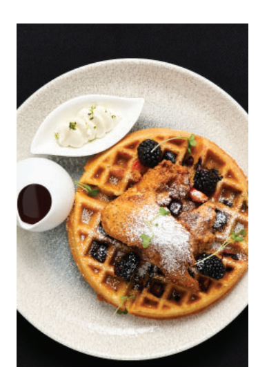
table tents, hotel rack cards, social media campaigns and ads in local magazines and radio. That year, all participating restaurants reported significant increases in sales and new customers, "This was an incredible opportunity and we were honored to be a part of it. We appreciate all of the effort put in by the city to highlight local restaurants" – Magnolia Room.

City's Convention and Visitor's Bureau, Discover DeKalb, in the hopes of generating business for local restaurants that struggled through the pandemic. Discover DeKalb's partnership with the City is funded by the Hotel Motel Tax and regulated by the state to be used for marketing and generating tourism for Tucker. In 2021 this included t-shirts for restaurant staff,