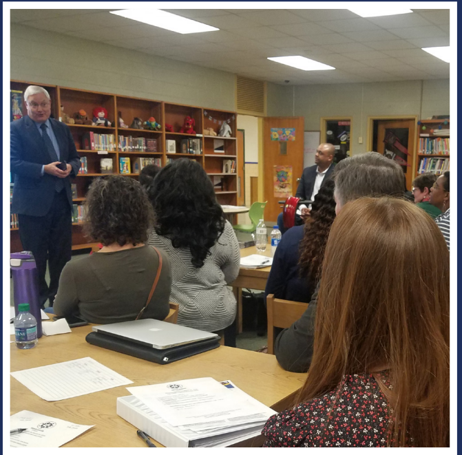
Members of the Tucker Cluster Council held their bimonthly meeting on March 19 receiving updates on the Smoke Rise Elementary replacement project, as well as a primer on International Baccalaureate (IB) education.

• DeKalb County Schools held a community meeting on March 7 to discuss plans with parents and other stakeholders for the replacement Smoke Rise Elementary School. The new school has a budget of $27.6 million and should be completed for the 2021-22 school year.