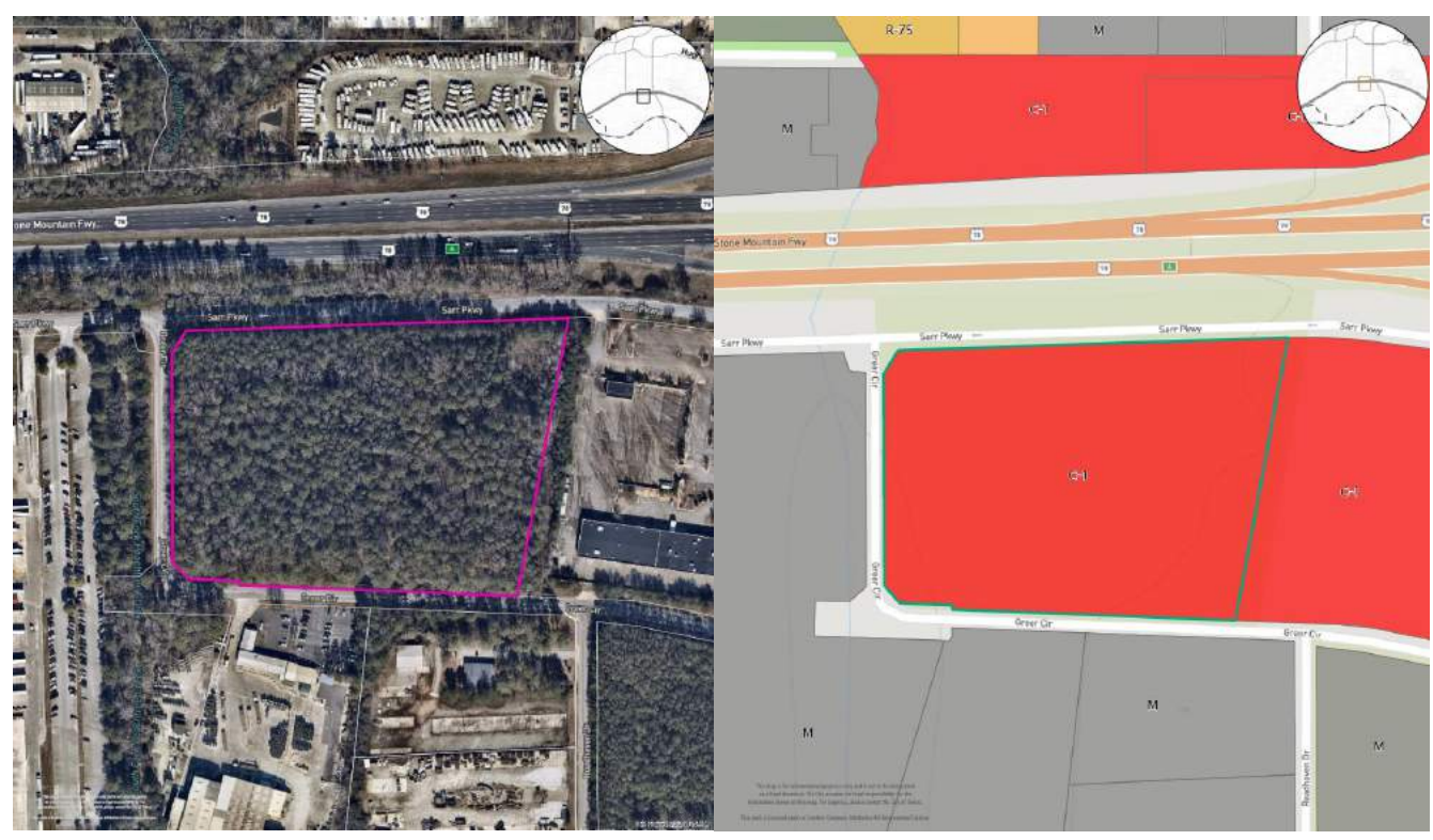
Aerial and Zoning Map Exhibits showing surrounding land uses.