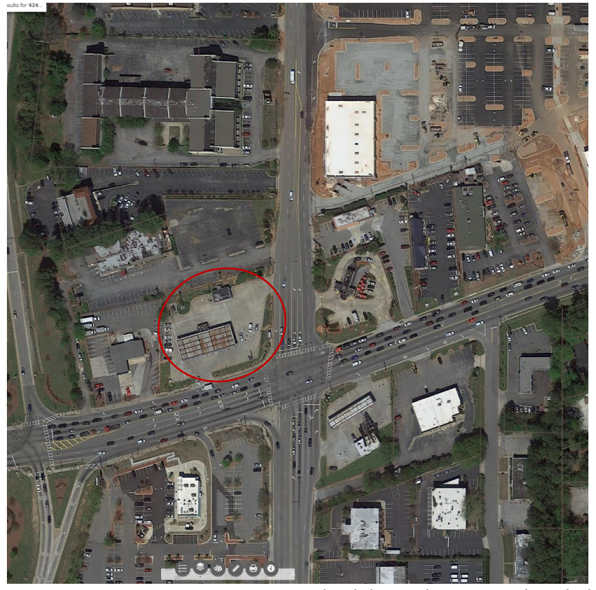
Aerial Exhibit. Subject parcel circled.