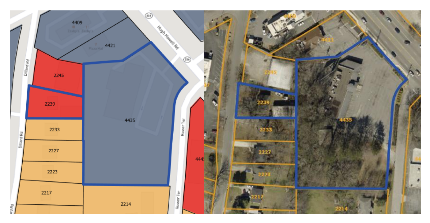
Zoning and Aerial Exhibits showing surrounding land uses.