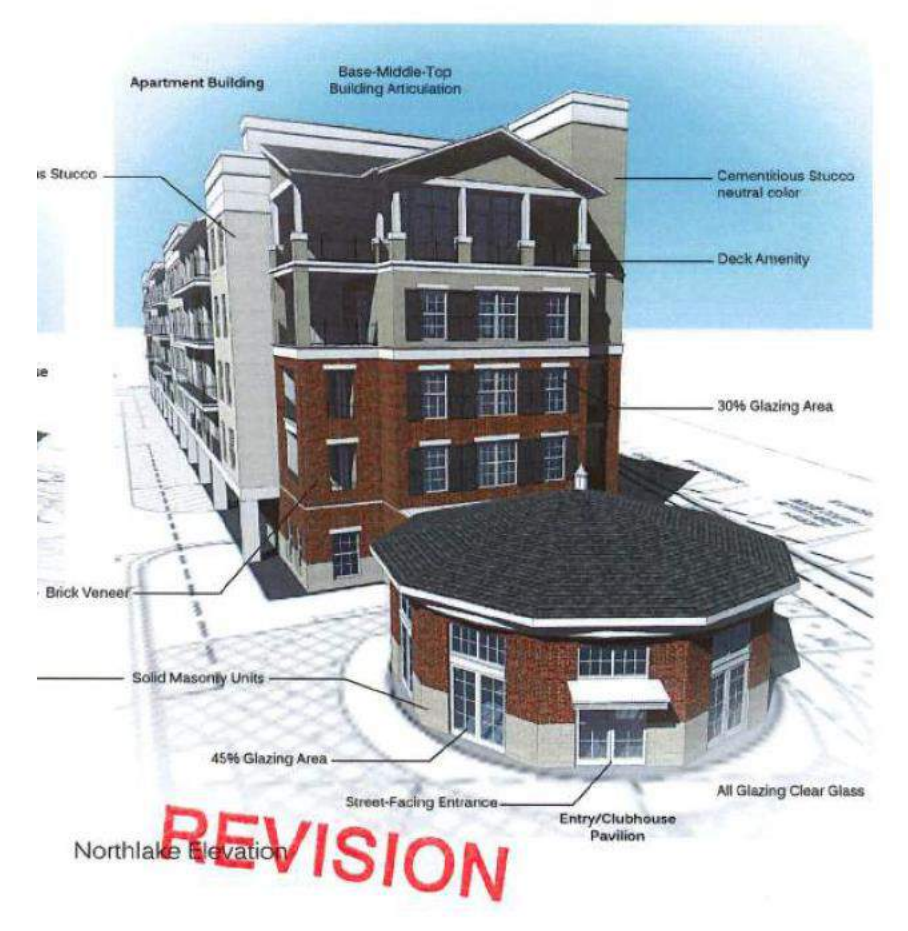
Architectural Elevation of Buildings (Front – from Northlake Parkway)