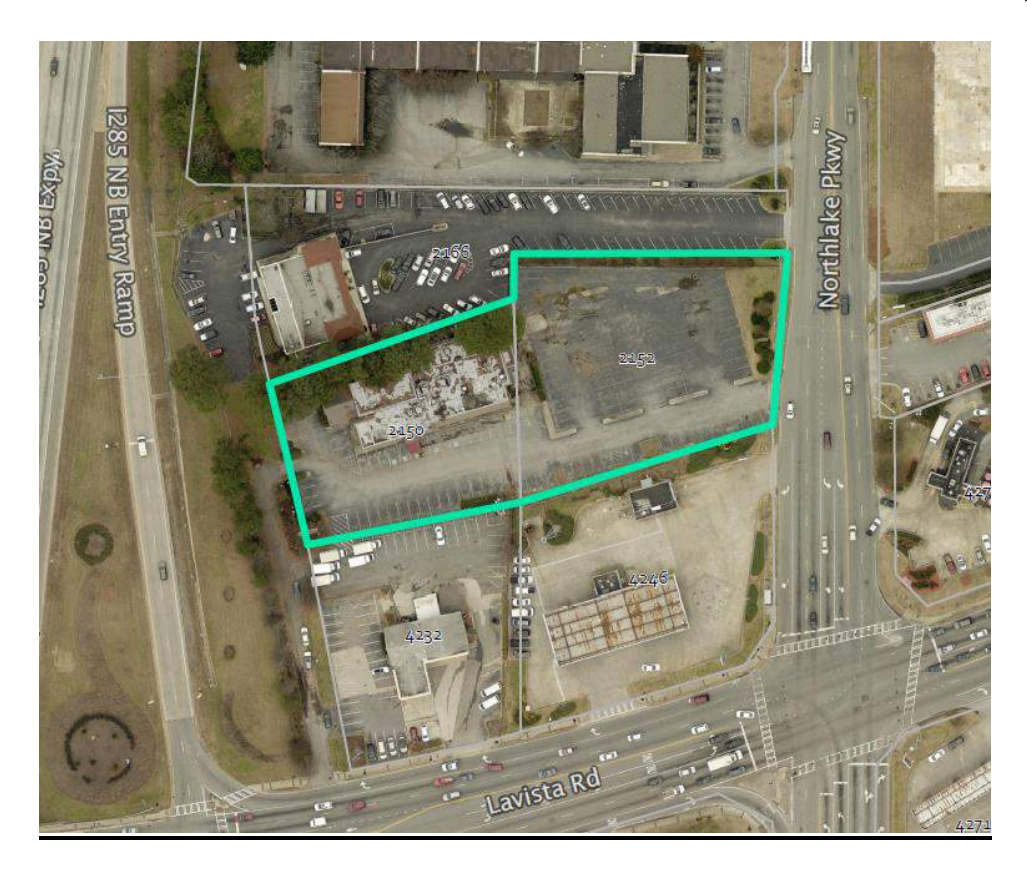
Aerial Image of Site and Vicinity