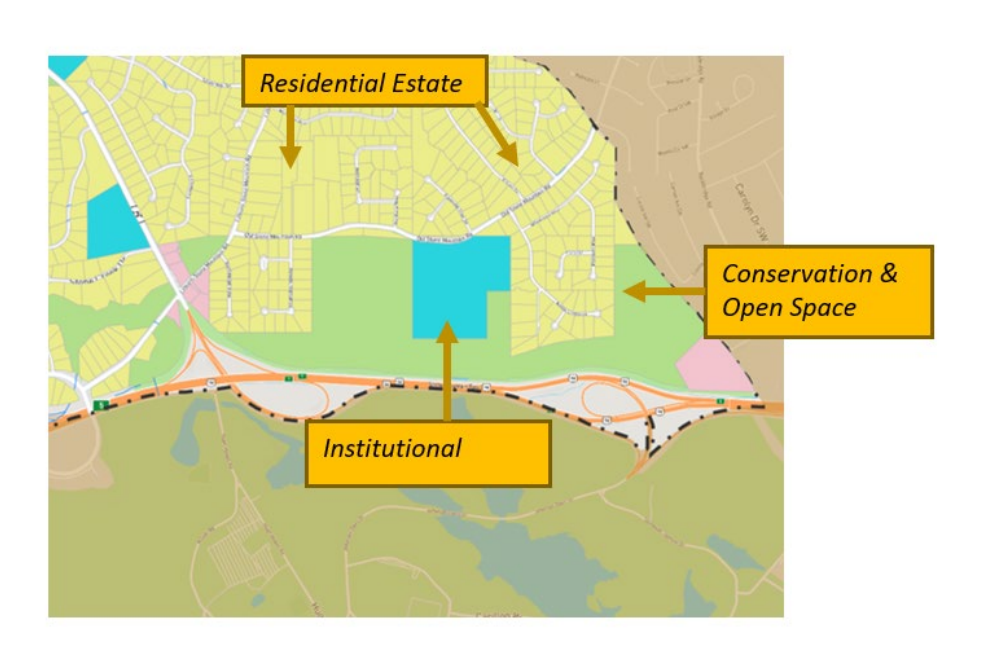
Exhibit showing surrounding Character Areas/ Future Land Use map