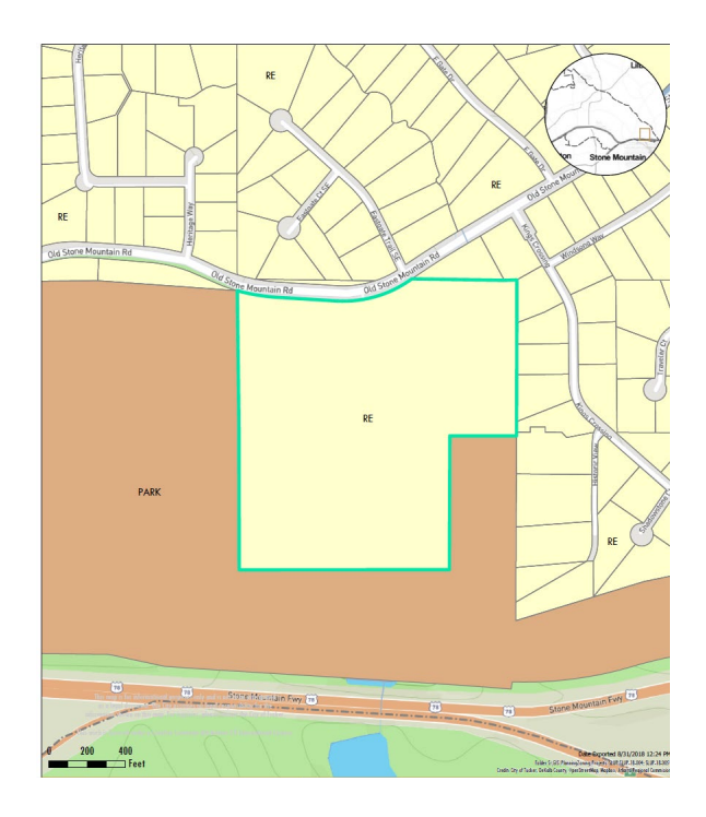
Zoning Exhibit showing surrounding zoning.

applicant requests approval of a SLUP through the City of Tucker to show good faith and establish the church and school as legal conforming uses. The applicant seeks this request to establish a new church and new school within the same footprint of the previous church and school.