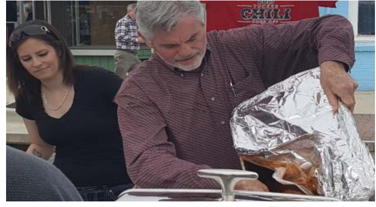
Team "Mosquito Authority White" was judged the overall winner. Matthews Cafeteria claimed top prize in the restaurant division.

City of Tucker Phone : 678-597-9040 4119 Adrian Street Email : info@tuckerga.gov