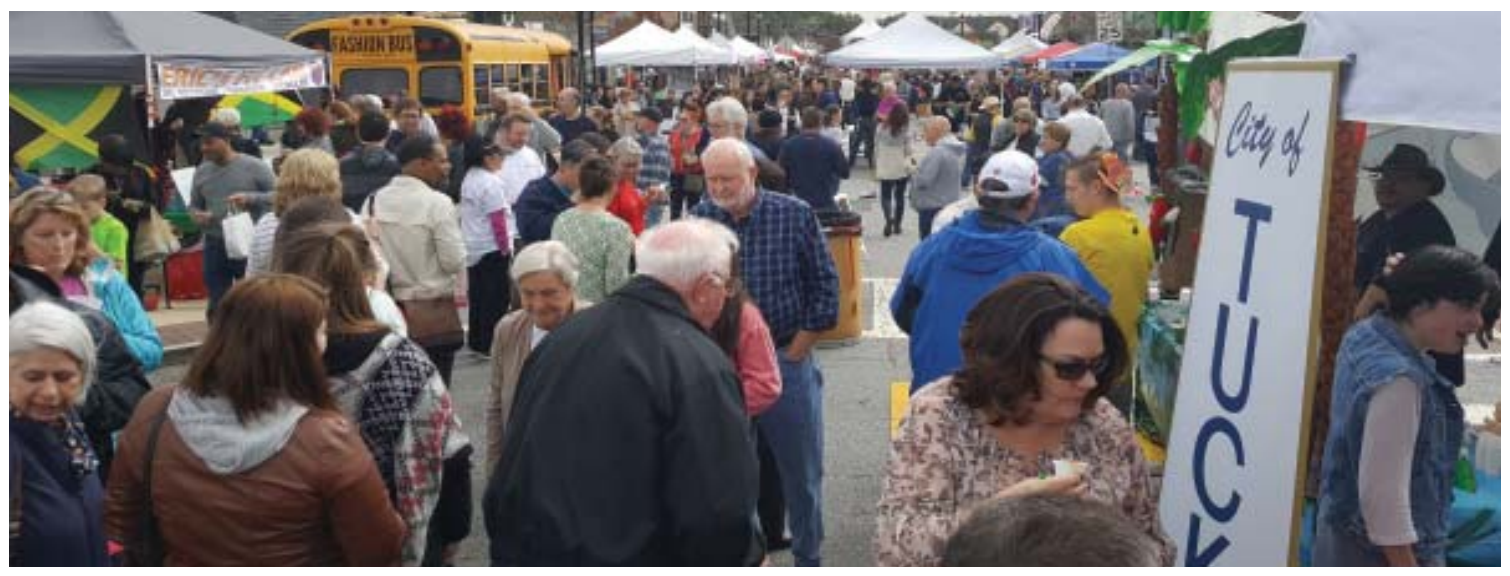
Thousands of chili enthusiasts packed Main Street on March 11 for the City's annual ode to seasoned meats and beans.