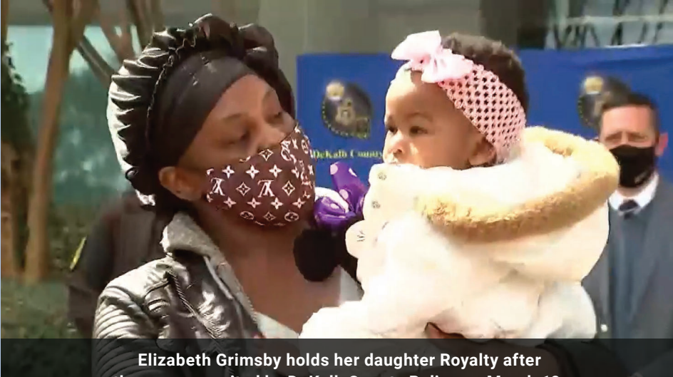
they were reunited by DeKalb County Police on March 18.

No one wants to have their property stolen. They most certainly don't want harm to come to their loved ones. That is why we all have to appreciate that a few moments is all that it takes for any of us to become a victim. That is also why we all must be constantly vigilant. If we can all work toward that goal, we can fight crime by not letting it occur to begin with.