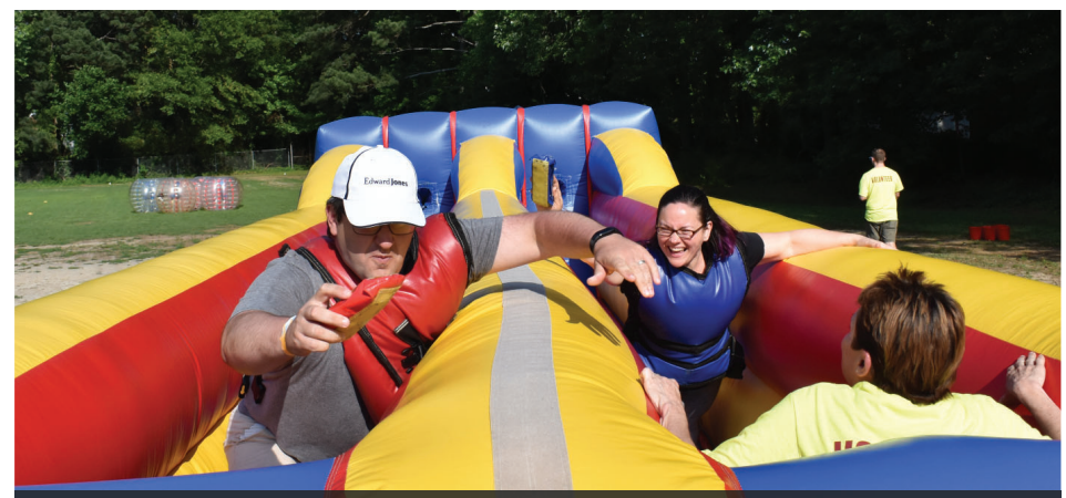
Tucker's popular Adult Field Day is set to return this May. It's one of several popular events put on throughout the year by the Tucker Parks and Recreation staff.

...the weather is just right for getting outside and getting some exercise. Thanks to our Mayor and City Council, we're soon going to have a new destination for folks to go and break a sweat; we're installing an outdoor fitness court. This court will be located on the site of the soon-to-be-demolished old DeKalb County library building, which is owned by the City. You may not have