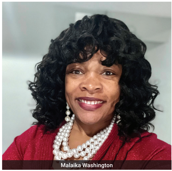
To learn more about the Tucker Cluster Council and receive notices about upcoming meetings please visit tuckerclustercouncil.org