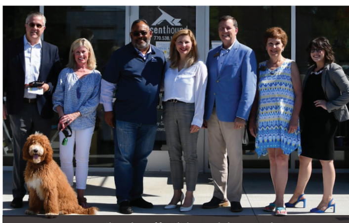
Baxter, Council and staff celebrated the grand opening of Scenthound Tucker in June.

a unique approach to grooming focusing on five core areas of routine and preventive care: Skin, Coat, Ears, Nails, and Teeth (SCENT) as in Scenthound.