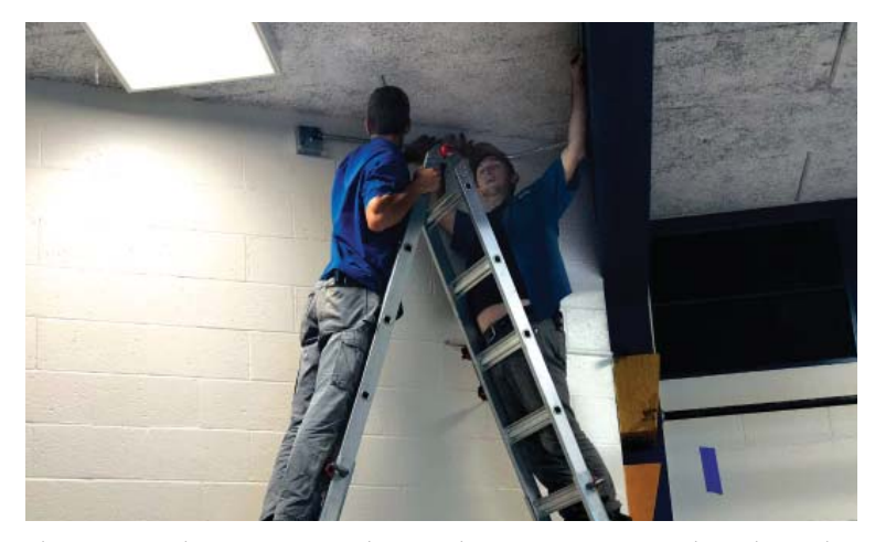
Electricians work on wiring upgrades at Tucker Recreation Center. These electrical improvements will save Main Street Theatre productions countless manhours in the future.

The next big production will be Sanders Family Christmas , a musical debuting November 30 at the Recreation Center. Before that, the troupe will be busy with an offsite production entitled Escapade. The interactive theater event will take place at various locations on Main Street on October 13 and 20. Tickets for all productions are available at tuckertheatre.com.