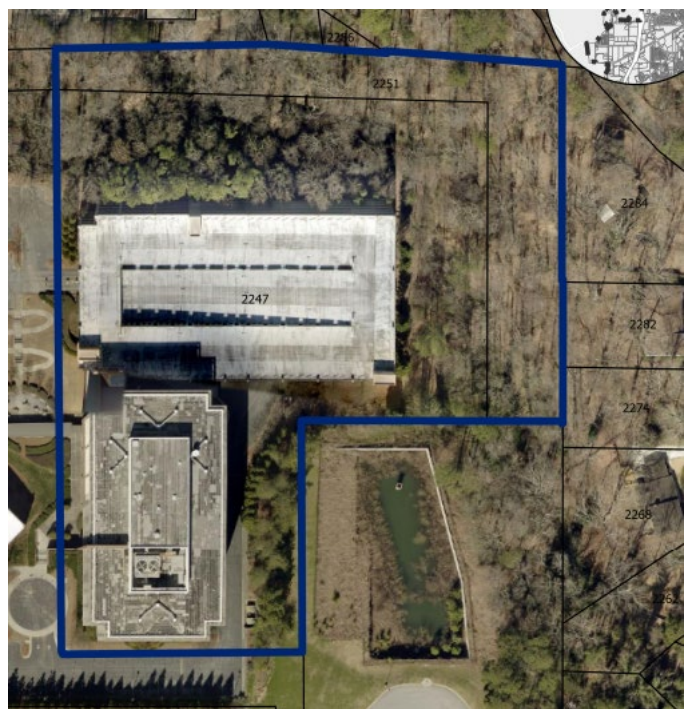
Zoning and Aerial Exhibits.